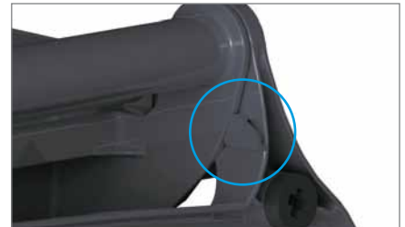
Dumpingstop on lid hinge