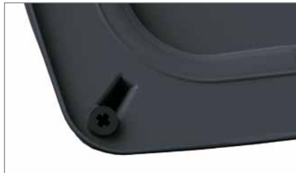
Optional noise reduction with rubber plug possible