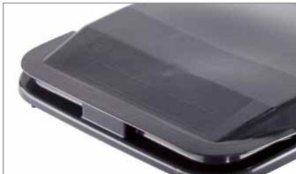
Lid with lip handle