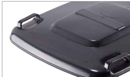
Lid with bow handle