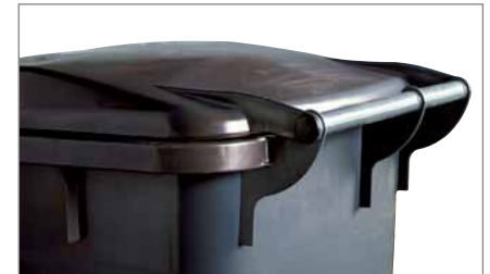
Handle diameter Ø 27 mm