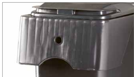
Diamond MGB 240